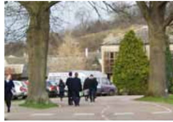
Wycliffe College, Stroud.

Safety inspections and reports form an important part of our consultancy workload. As well as our many private clients, corporate clients and institutions include Cheltenham College and Ladies College, Gloucestershire NHS Trust, Stroud District Council, Borough, Town and Parish councils.